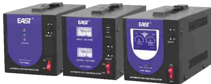
500VA ~ 5000VA

AVR series AC automatic regulators apply the advanced control technology with well qualified components. It has the features of wide input voltage compatibility, high reliability, output voltage stabilizing, energy saving etc.; it has over voltage and low voltage protection and delayed output protection etc.. it could supply stabilized power to lights, TVs, air-conditioners, refrigerator, computers and duplicating machines and other household equipment in schools, offices, hotels, meeting rooms where the stabilized voltage is needed.