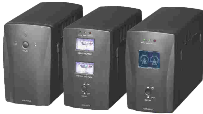
500VA ~ 1000VA